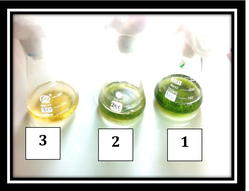
Fig1: Growth of Chroococcus turigidus (1) in different media after five weeks

The growth rate of the algae seemed to be directly associated with morphological configurations. The normal morphological configuration was observed in BG11 Broth w/Minerals. Most of the cells were healthy, bright green and having intact chloroplast up to five weeks. Five week onwards certain cells were noted to be unhealthy for the two isolates of Chroococcus turigidus figure -2. BG11 Broth was second best medium for promoting the growth of Chroococcus turigidus . In this culture, healthy appearance of the cells was maintained up to four weeks with the exception of the few cells. Subsequent observations revealed unhealthy for the two isolates of Chroococcus turigidus figure -2. Chu -10 Medium was found third best medium in terms of growth. In this medium cells were having green, intact chloroplasts, but some unhealthy cells were also seen in the third week figure -2.