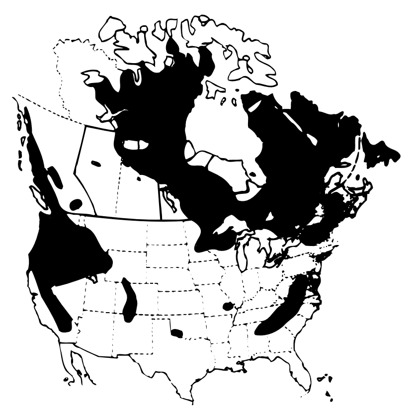
Figure 13-2 Regions of North America with low soil alkalinity to neutralize acid rain.

Acid rain falling over most of the world has little environmental effect on the biosphere because it is rapidly neutralized after it falls. In particular, acid rain falling over the oceans is rapidly neutralized by the large supply of CO_3^{2-} ions (chapter 6). Acid rain falling over regions with alkaline soils or rocks is quickly neutralized by reactions such as (R9) taking place once the acid has deposited to the surface. Only in continental areas with little acid-neutralizing capacity is the biosphere sensitive to acid rain. Over North America these areas include New England, eastern Canada, and mountainous regions, which have granitic bedrock and thin soils (Figure 13-2).