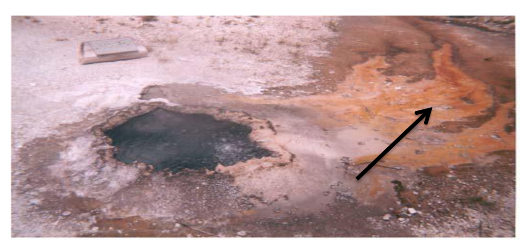
Figure 1. Photograph of a thermal pool in Yellowstone National Park. The temperature of the water in the pool is at the boiling point for that altitude. As the water in the outflow on the right cools, an orange coloration begins to appear in the water (arrow) and continues downstream for several feet. At the mid-point of that coloration, the average temperature is 80oC. The organism responsible for the color is Thermus aquaticus .

DNA polymerase sequentially adds nucleotides complimentary to template strand at 3'-OH of the bound primers and synthesizes new strands of DNA complementary to the target sequence. The most commonly used DNA polymerase is Taq DNA polymerase (from Thermus aquaticus , a thermophillic bacterium) because of high temperature stability (Figure 1). Pfu DNA polymerase (from Pyrococcus furiosus ) is also used widely because of its higher fidelity (accuracy of adding complimentary nucleotide).