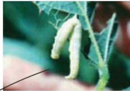
Caterpillar that has died from baculovirus infection

Vertical transmission and vector transmission of a number of invertebrate viruses have been reported. Vertical transmission may occur either within eggs (transovarially) or on the surface of eggs. Vectors involved in virus transmission between insect hosts include parasitic wasps.