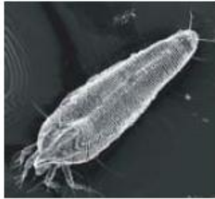
Ryegrass mosaic virus