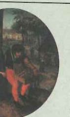
efits its Master by r Breugel